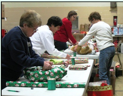
Thanks to all our donors and volunteers!