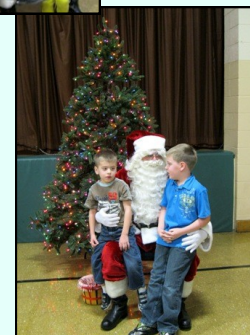
Photos from Breakfast with St. Nick